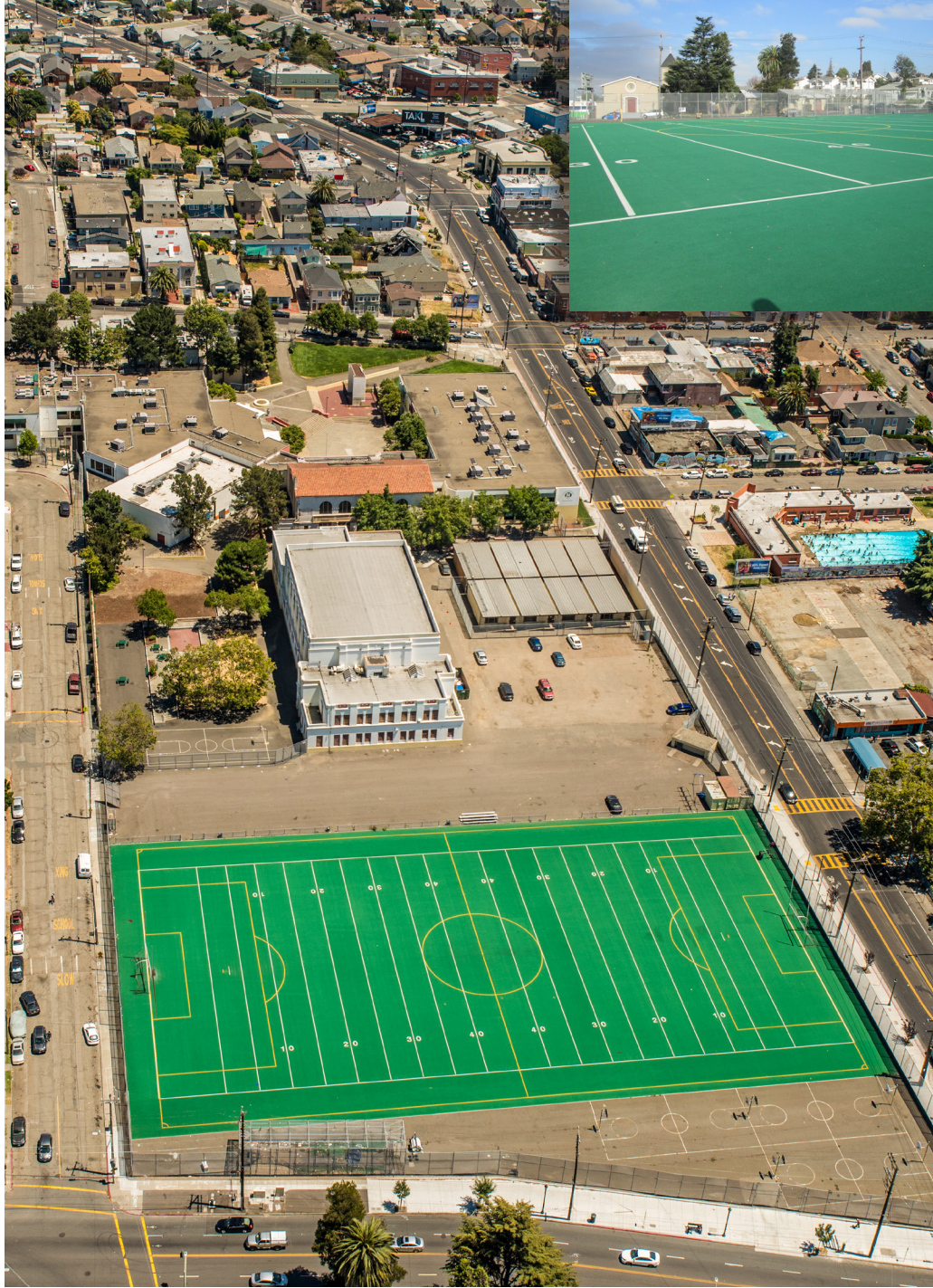
Previous 84-yard long football field