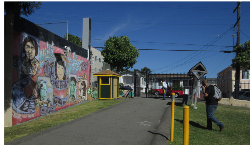
Previous Campus Entry