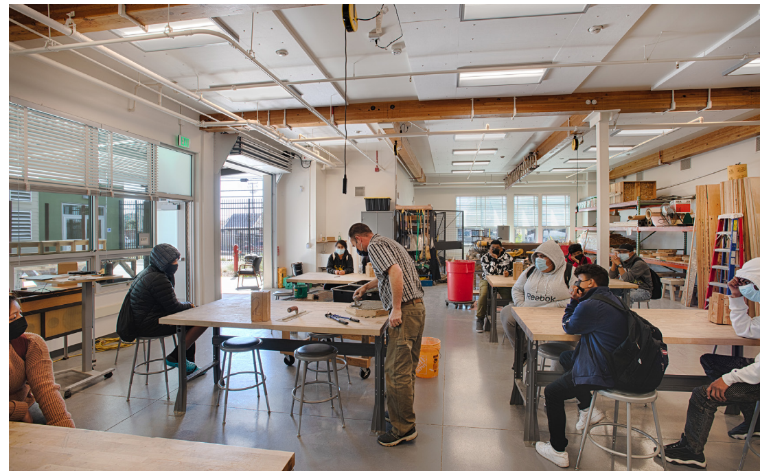
Indoor/Outdoor Skills Trade Lab