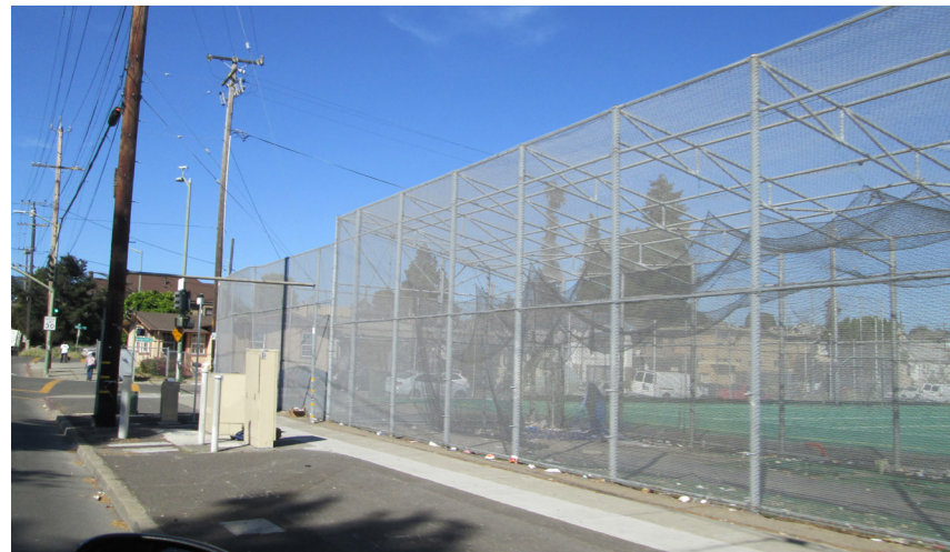
Previous chain-link fencing around perimeter