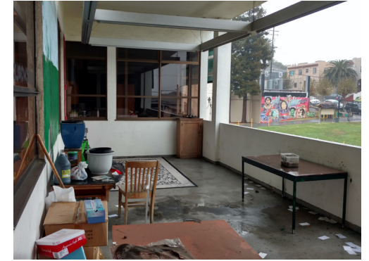
Previous Outdoor Work Area