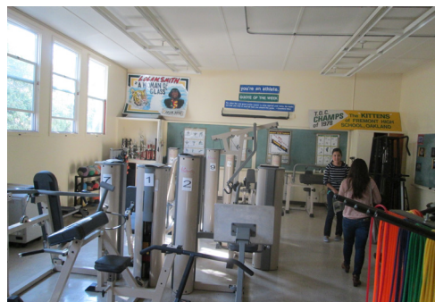
Previous athletics facilities